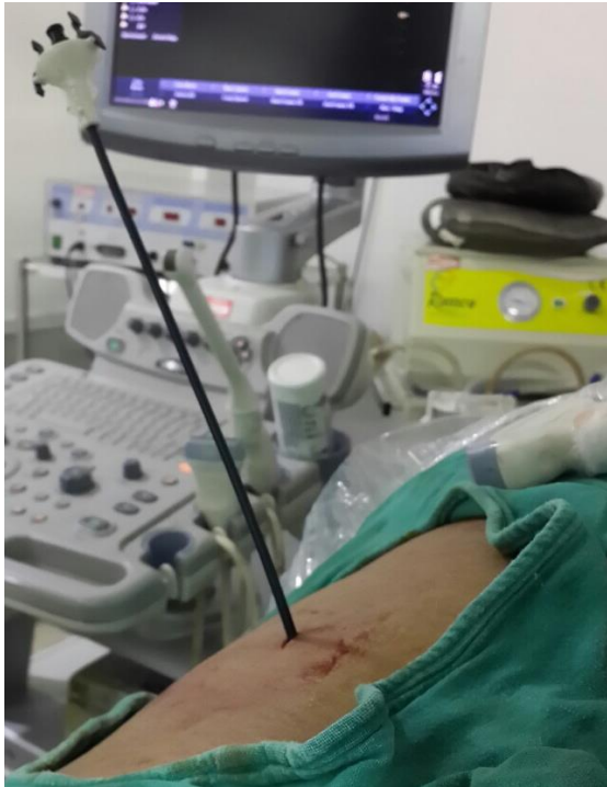
Figure 4: Placement of 9F access sheath after dilatation

Flexible ureteroscope was inserted through the access sheath and stone at the distal ureter visualized. Laser fragmentation ( Figure 3B ) was initiated but it was ergonomically very challenging due to long redundant part of access sheath outside, and position of the stone at distal end.