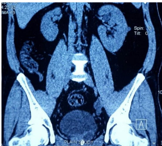
Figure 2: Initial non-contrast CT KUB film showing hyperdense shadow in prostatic urethra, dilated upper moiety of left kidney. The parenchyma of left kidney however, appears normal

CT IVU was done to further delineate the anatomy of the ureter ( Figure 2 ). The parenchymal thickness of the left kidney appeared to be preserved.