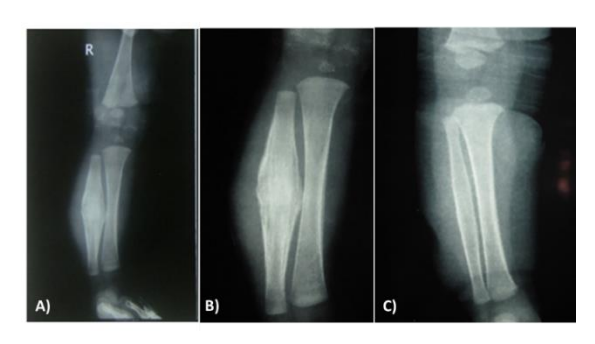
Figure 1: Serial X-ray pictures of the child showing progression of the disease, A) Xray at the time of presentation showing diffuse thickening of fibula with periosteal reaction, B) X-ray of the same child after 3 months of onset of disease showing increase in the size of bones with periosteal reaction, C) X-ray after one year showing healing of the disease

The child was admitted and investigated further. The laboratory tests showed an ESR of 18 mm/hr, C-reactive protein of 2.9 mg/L, WBC count of 9,100 with predominant lymphocytosis. His hemoglobin was 8.6 mg% and serum alkaline phosphatase was 1540 IU/L with normal serum calcium and phosphorus.